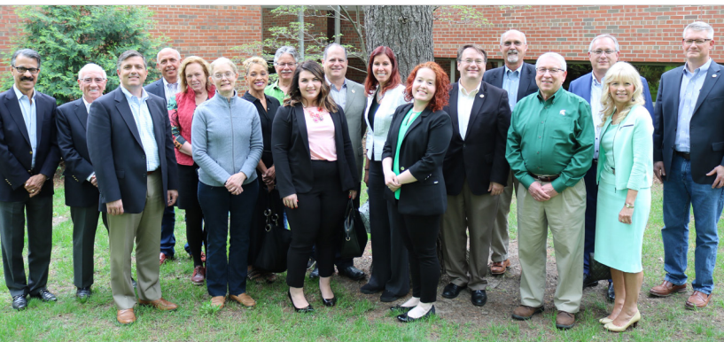
One of Michigan State University's industrial advisory boards.

In addition to the IAC and the professional societies, ABET engages with industry through several other channels. Industry experts make up a significant portion of the pool for Program Evaluators and Team Chairs, the ABET volunteers who lead program accreditation visits. Central to ABET's Continuous Quality Improvement (CQI) process is a requirement that programs solicit feedback from the program's various constituencies, which include local employers through Industry Advisory Boards (IAB). Industry leaders are also members of ABET governance, having seats on the Board of Directors and Board of Delegates.