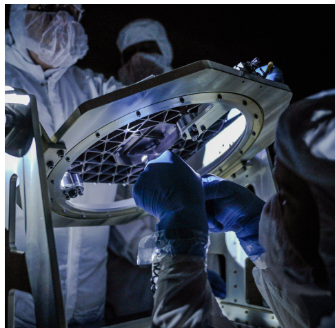
Engineers at NASA's Goddard Space Flight Center inspect a component for the James Webb Space Telescope.

Recognizing the impact of cybersecurity issues on nearly every aspect of our lives, ABET's 2019 Annual Symposium focused on cybersecurity challenges and the need to have a workforce prepared to counter the rapidly evolving threat. It